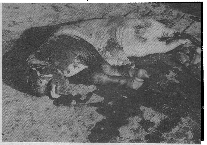
Fig. 2: Anasarcous buffalo calf