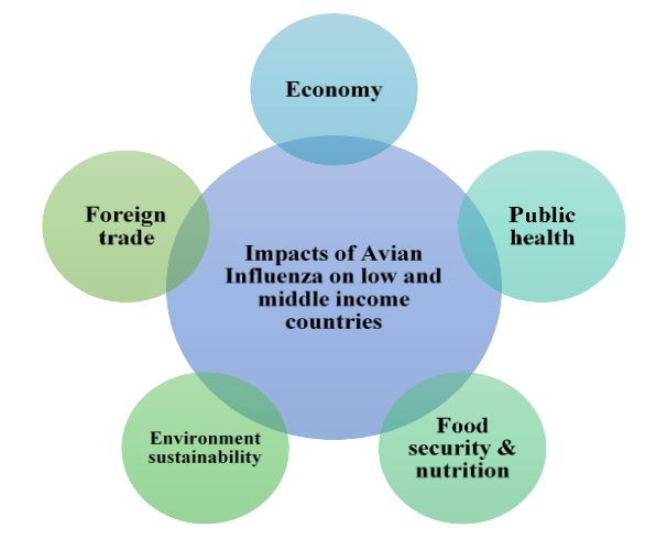
Fig. 2: Possible impacts of Avian Influenza outbreaks on LMICs.

Ultimately, preventive measures, such as improved biosecurity practices, disinfection, and waste management systems, help reduce the contamination environmental impact of avian influenza outbreaks (Islam et al., 2023). This contributes to sustainable agriculture and minimizes environmental contamination in LMICs (Kaneda et al., 2023). LMICs often rely on international trade for their poultry products. Implementing robust preventive measures can enhance the safety and quality of poultry products, meet international standards, and facilitate trade (Zhou et al., 2019). By demonstrating a commitment to preventive measures. LMICs can build trust and poultry confidence in their products, opening opportunities for export and economic growth (Aday and Aday, 2020; Skripnuk et al., 2021).