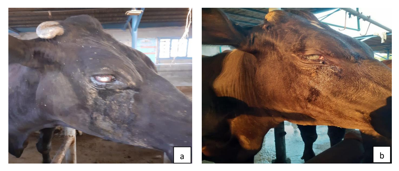
Fig. 3: Clinical picture of Pinkeye in dairy cattle demonstrating corneal ulceration (a), corneal opacity and blindness (b)

OR= Odds ratio, CI=Confidence interval; *BCS: Body condition score; BCS was assessed on a scale from 1 to 5, where 1 indicates an extremely thin cow and 5 indicates an excessively fat cow; ** Cow hygiene score was assessed on a scale from 1 to 5, where 1 indicates very clean and 4 indicates very dirty cow; ***Stage 1 (Mild): Increased tearing and mild conjunctivitis with slight redness and swelling around the eyelids. The cornea remains clear. Stage 2 (Moderate): More pronounced conjunctivitis and keratitis, cornea appears cloudy with small ulcer, and photophobia. Stage 3 (Severe): Corneal ulcer is larger and deeper, covering a significant portion of the cornea. Cow exhibits signs of pain and discomfort, such as excessive blinking or squinting. Stage 4 (Advanced): The ulcer extends deeper into the cornea, potentially causing a rupture. Severe inflammation, eye permanently damaged, leading to blindness.