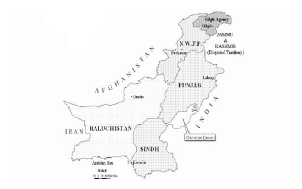
Fig. 1: Location map of Cholistan desert

Rajhastan Desert in India (FAO/ADB, 1993; Jowkar et al. , 1996, Fig. 1). It starts some 30 Km from the main city of Bahawalpur, Punjab, Pakistan and sprawls over an area of 26000 Km² (Mughal, 1982), located between the latitudes 27°42′and 29°45′North and longitudes 69°52′and 75°24′East.