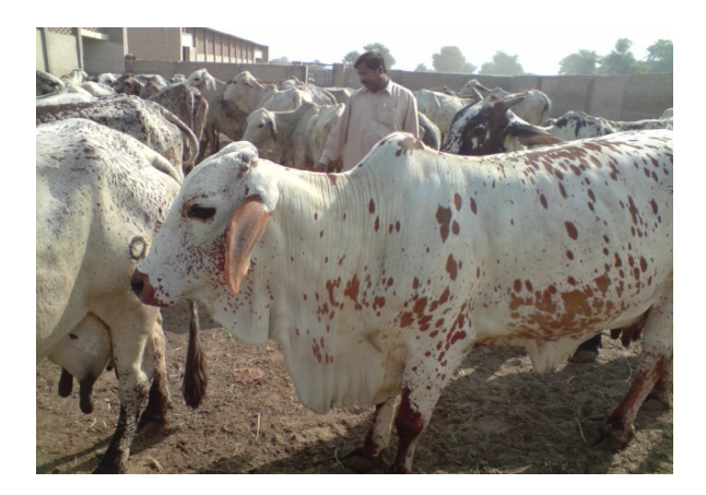
Fig. 3: Elite specimen of Cholistani cow with the milk yield of 15-18 liters per day maintained at the Govt. Livestock Farm, Jugaitpeer, Bahawalpur, Pakistan.