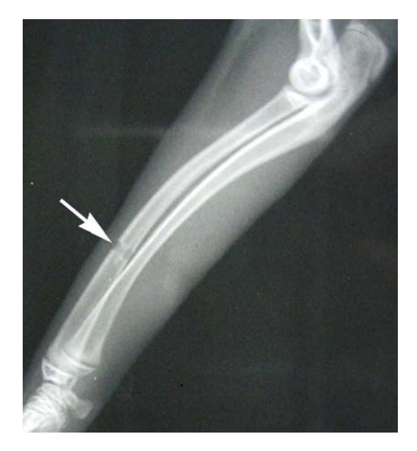
Fig. 3: Subjective evaluation grade I (decreasing size of the drilled holes is 0%).