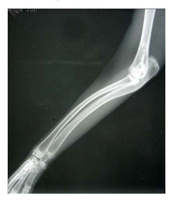
Fig. 8: Subjective evaluation grade VI (decreasing size of the drilled hole is 100%).

study, we will have some challenge with results of another study. Nottbaert et al. (1989) declared that lipid material extracted from the omentum contained a potent angiogenetic activator. Oloumi et al. (2006) showed the acceleration of bone healing by increasing of angiogenic potency due to the presence of angiogenetic activator. According to the results of our study we think that different part of omentum, depends on the amount of macroscopic fat deposition, can have different potential in omentalisation for the acceleration of bone healing. We recommend that using the part of omentum with no macroscopic fat deposition (if it is possible according to the patient body condition) has more efficiency in acceleration of bone healing process.