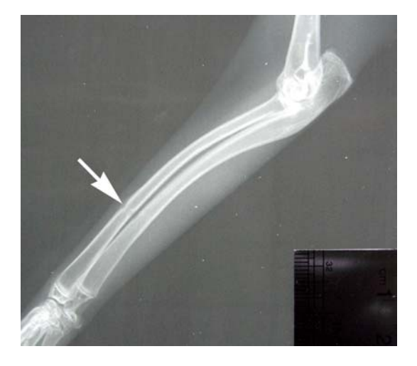
Fig. 5: Subjective evaluation grade III (decreasing size of the drilled hole is 26-50%).