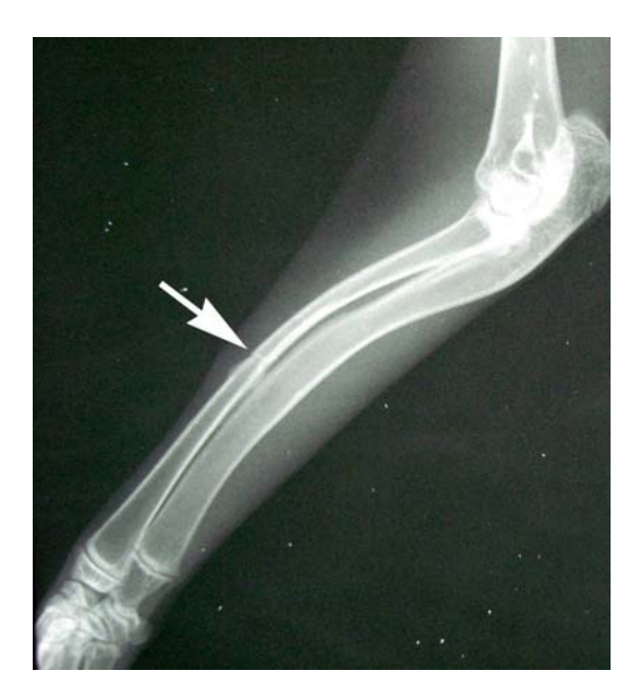
Fig. 7: Subjective evaluation grade V (decreasing size of the drilled hole is 76-99%).