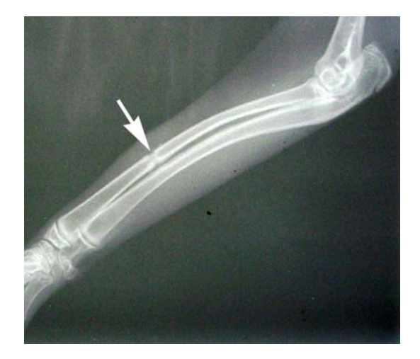
Fig. 4: Subjective evaluation grade II (decreasing size of the drilled hole is 1-25%).