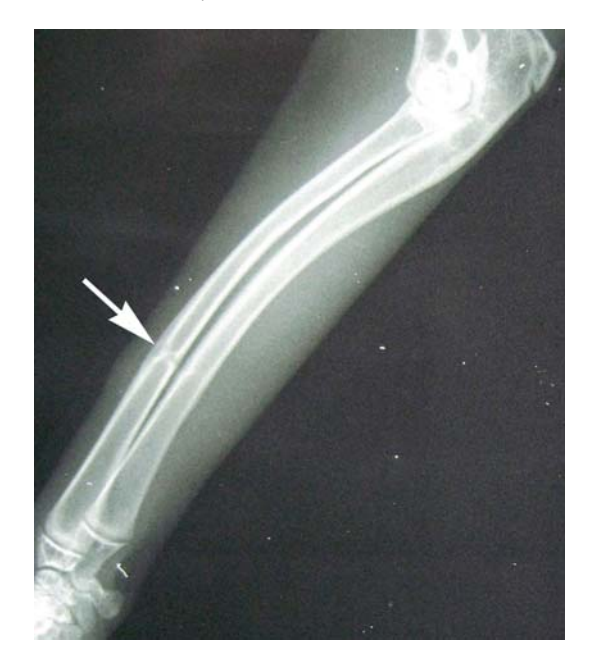
Fig. 6: Subjective evaluation grade IV (decreasing size of the drilled hole is 51-75%).