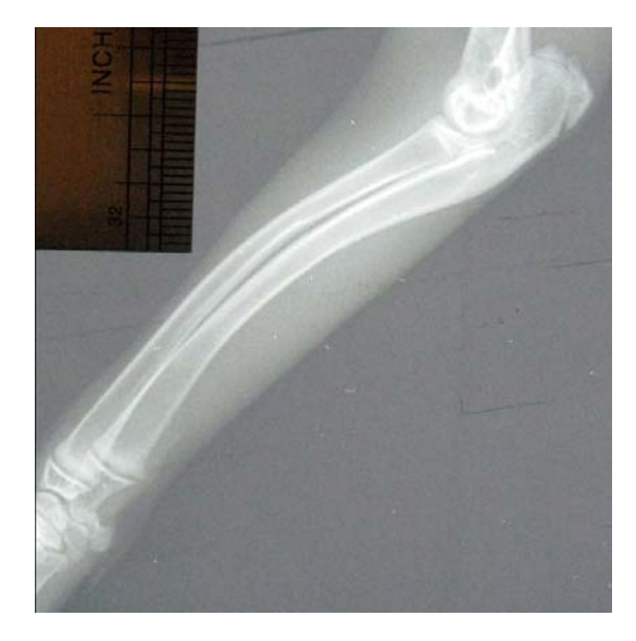
Fig. 2: The lateral view radiograph of rabbit's normal forelimb