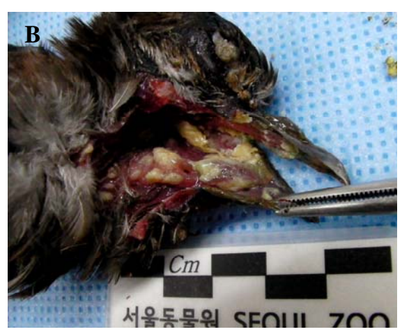
Fig. 1: Photograph of an Oriental Turtle-dove: A, wart-like proliferations on the skin of the legs and head. B, multiple discrete, pale yellow to cream-colored, raised necrotic lesions was distributed irregularly across the oropharyngeal mucosa.