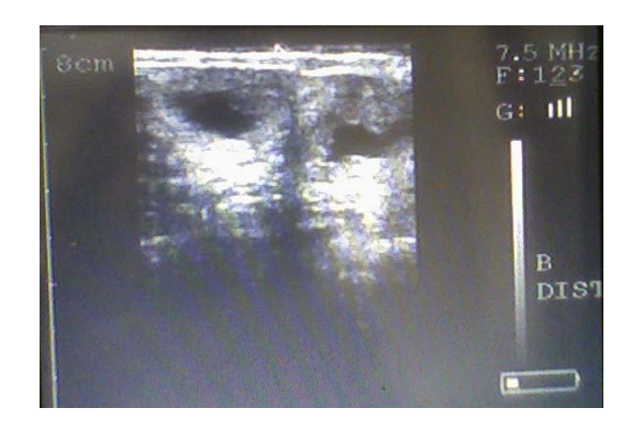
Fig. 2: The cyst was found to be smaller and measured as 33x31 mm in diameter and luteinization was also observed