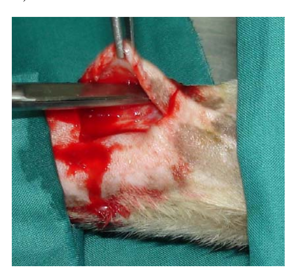
Fig 1: Excision of full thickness skin segment from middle radial area of the dog.

Wound preparation for grafting: In the animals of group A, B and C, after induction of anesthesia, a full thickness skin segment measuring 3×3, 4×4 and 5×5 sq cm, respectively was excised from lateral aspect of mid radial area of forelimbs (Fig. 1) slowly and meticulously avoiding the muscular damage. The wounds/defects thus produced were left as such for four days to allow granulation tissue to develop (Fig. 2). Meanwhile, daily dressing was maintained with sterile gauze and cotton bandage using pyodine. On 4th day, after clinical assessment and confirmation of granulation tissue on the limbs, a complete procedure of harvesting and grafting was accomplished for which the wounds were debrided to remove excess of granulation tissue and made afresh for acceptance of graft (Shahar, 2001; Adams and Ramsey, 2005).