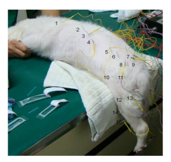
Fig. 2: Acupuncture Points: 1; GV-14, 2; BL-18, 3; BL-22, 4; BL-23, 5; GV-2-1, 6; BL-25, 7; BL-26, 8; BL-27, 9; BL-28, 10; GB-301, 11; GB-302, 12; GB-31, 13; BL-37, 14; GB-34, 15; ST-36, 16; BL-60, 17; KI-1.