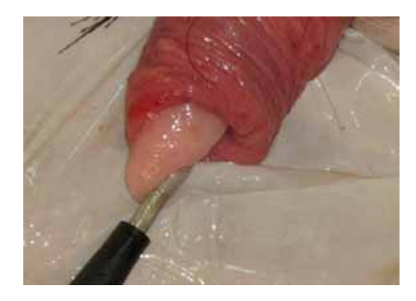
Fig. 3: Retrograde catheterization by Rayle's tube No. 10. Notice the supporting wire in position, and the voided urine from the catheter.

Urethrolithiasis with intact bladder is a critical condition that requires immediate surgical intervention for correction of the condition to avoid rupture of the urethra or the bladder, or even death of the calf (Kalim et al. , 2011). Surgeons in such situation prefer rapid simple technique that required minimal hospital setting, associated with minimal complications, and when possible of low cost. However, the used technique in this study has all of these advantages and moreover, it can be used under field condition. In spite of the observed complications