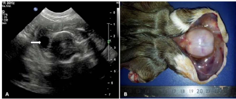
Fig. 1: Comparison between ultrasonographic (A) and necropsic (B) appearance of subcutaneous oedema of the head in the most severely affected puppy. Subcutaneous oedema is marked with the white arrow in the ultrasound capture.