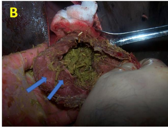
Fig. 4: A: Image of reticulum observed in the right abdominal cavity during the operation. B: Image of the honeycomb shape of reticulum observed during the operation.

Medical history of the animal indicated that no marked complications with the cow had been noticed until the parturition, implying that the ectopic reticulum did not obstruct the passage of the ruminal content into the lower parts of the alimentary canal. Nonetheless, It was opinion that accumulation of excessive volatile fatty acids in the rumen and abomasum due to feeding of the animal with excessive concentrated food during the dry period, development of the negative energy balance in the postpartum period, suffering from hypocalcaemia, generation of inflammatory mediators induced by other diseases, hypomotility in gastrointestinal system due to vagal nerve hypofunction, and occurrence of sudden enlargement in the abdominal cavity right after the parturition in dairy cows (Zadnik et al. , 2001; Van Winden