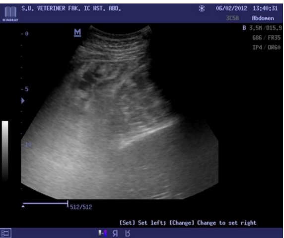
Fig. 3: Sonogram view of right fossa paralumbal area in the present case.