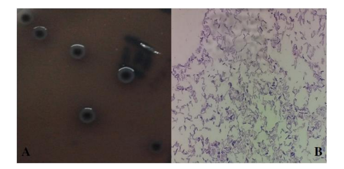
Fig. 2: (A) Typical black colonies of C. perfringens on TSC media showing lecithinase activity with egg yolk supplement in the media. (B) Showing microscopic slide of C. perfringens 100X oil immersion lens.

PCR for molecular typing of C. perfringens : The DNA extraction was performed using bacterial DNA extraction kit TIANGEN® (TIANamp Genomic DNA Kit, Catalogue no. DP302). The bacterial colonies were further sub cultured on the TSC media for purification. After purification, loop full black colonies of C. perfringens were picked for the extraction of DNA. The extracted DNA was checked for the purification and quantification using Nano-drop at 260/280nm wavelength. The DNAs were then immediately shifted to freezer for storage at -20°C till analysis by PCR.