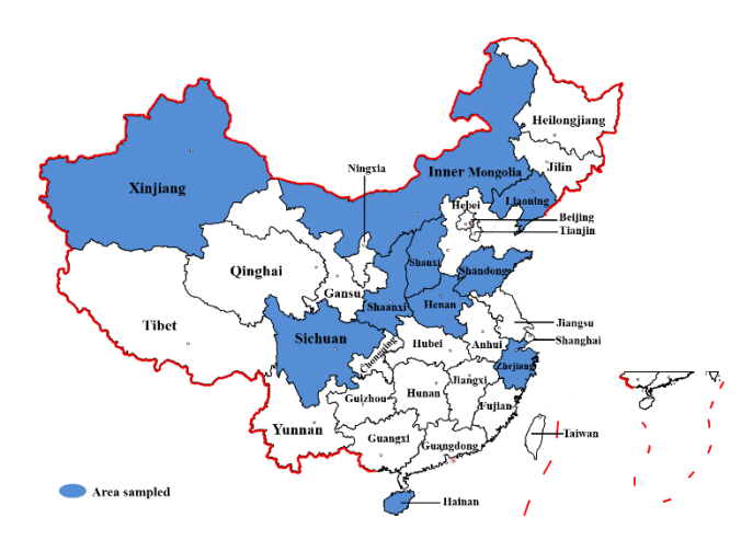
Fig. 1: The geographical distribution of milk samples collected in China. The blue-marked provinces indicate where the samples were collected.